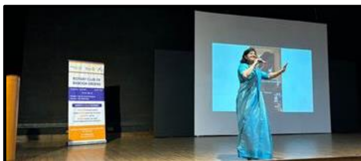
Rotary Club of Baroda Greens held an interesting "Anmol Zindagi," expert discourse.