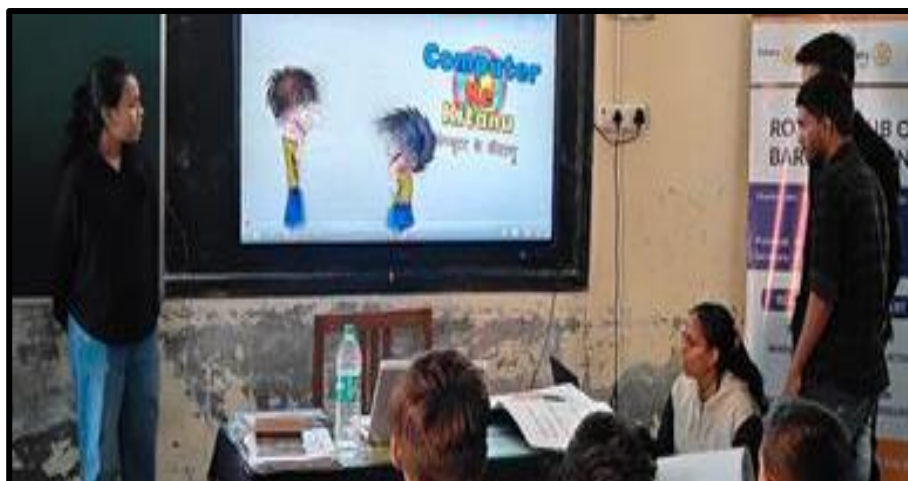
Workshop on Online Safety "Cyber Smart Kids" Hosted by PIET-DS