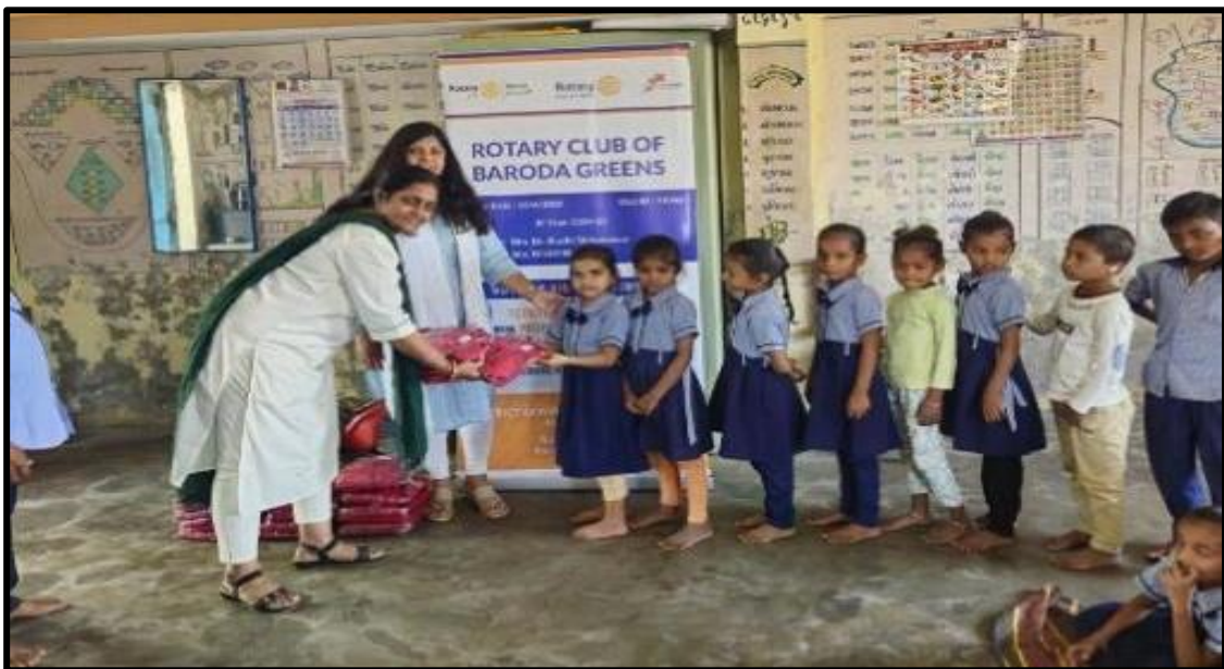
The Shankarpura Village Sweater Distribution Drive