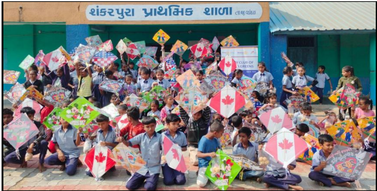
Kites and Chikkis at Shankarpura Primary School