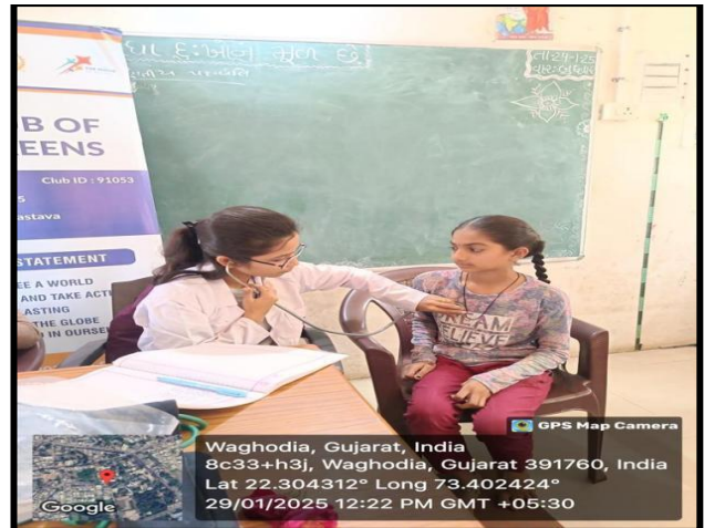
Female Student Health Checkup Camp in Waghodia Kumar Shala