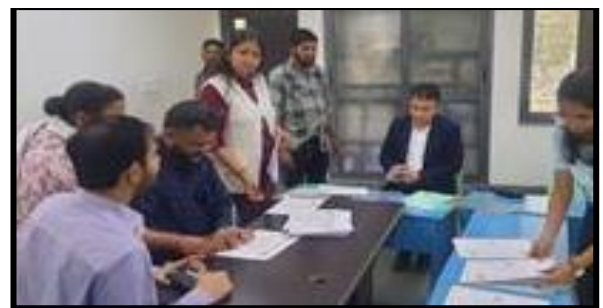
The Louis Braille Birth Anniversary Writing and Comprehension Competition