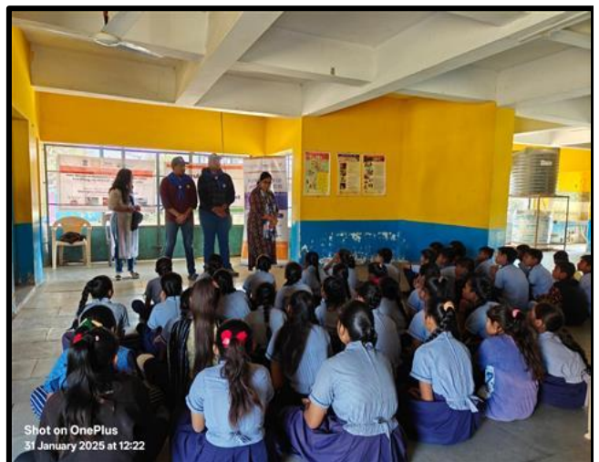
Rotary Club Baroda Conducts World Wetlands Day Awareness Presentation at Shankarpura Primary School