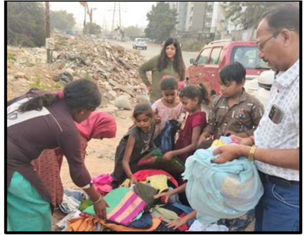
Helping Hands Clothing Drive Hosted by the Rotary Club of Baroda