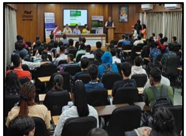
Inter-College Elocution Competition on Green Technology Held