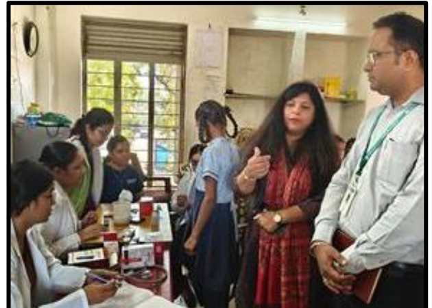
Anemia Mukt Bharat Abhiyan at Waghodia Kanya Shala