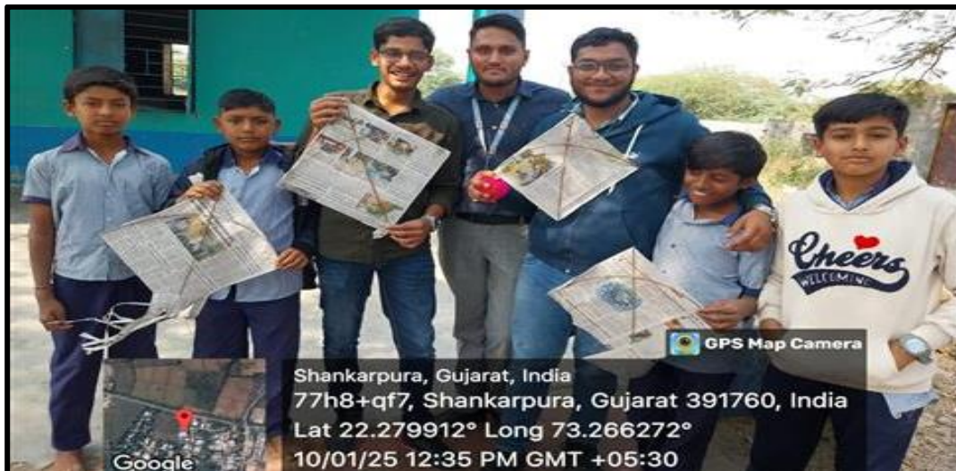
Kite Making Workshop Held at Shankarpura Primary School