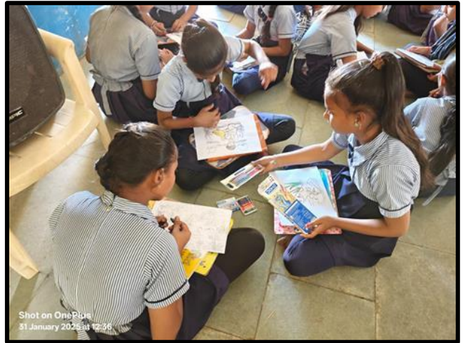
Shankarpura Primary School Holds Art Competition to Bring Attention to Wetland Animals