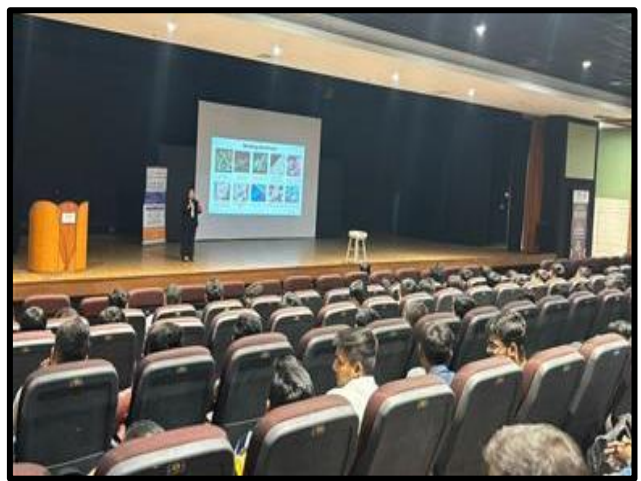
"Role of Social Media in Cyber Fraud" Expert Talk at Parul Institute of Engineering & Technology