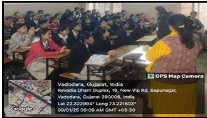
Career Counseling Session Held at Sadhu Vaswani School