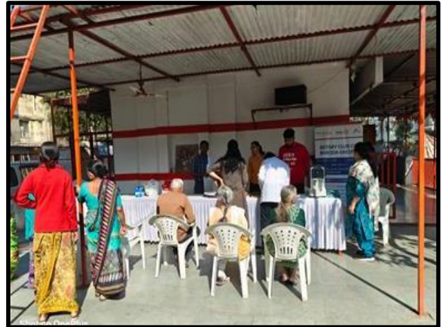
Camp for Eye Exams at Dindayal Nagar Hosted by the Rotary Club of Baroda Greens