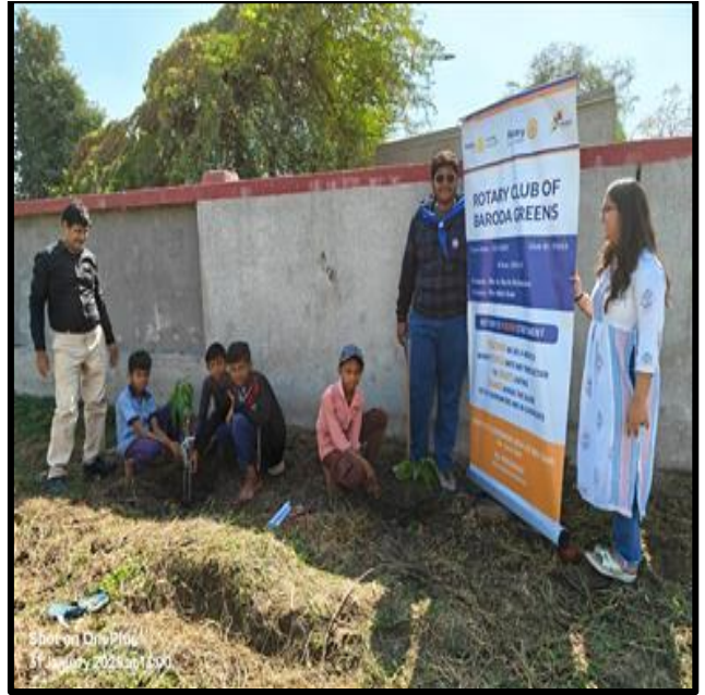
Shankarpura Primary School Holds Tree Plantation Drive in Honor of World Wetlands Day