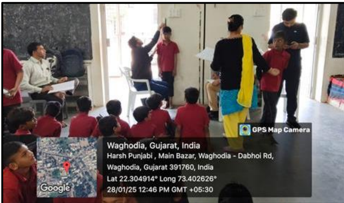
Healthcare Camp at Waghodia Kumar Shala