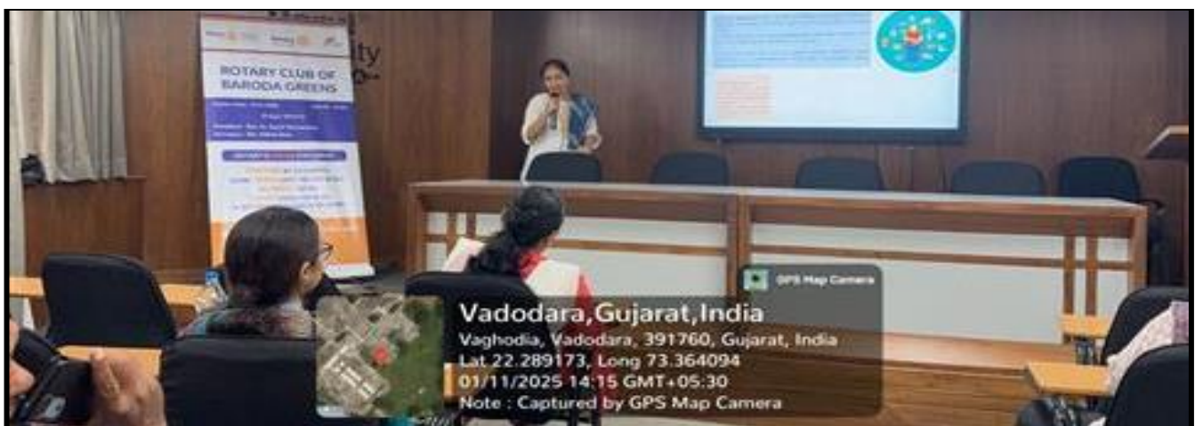
Seminar on Nutraceuticals: A Key Player in Modern Lifestyle