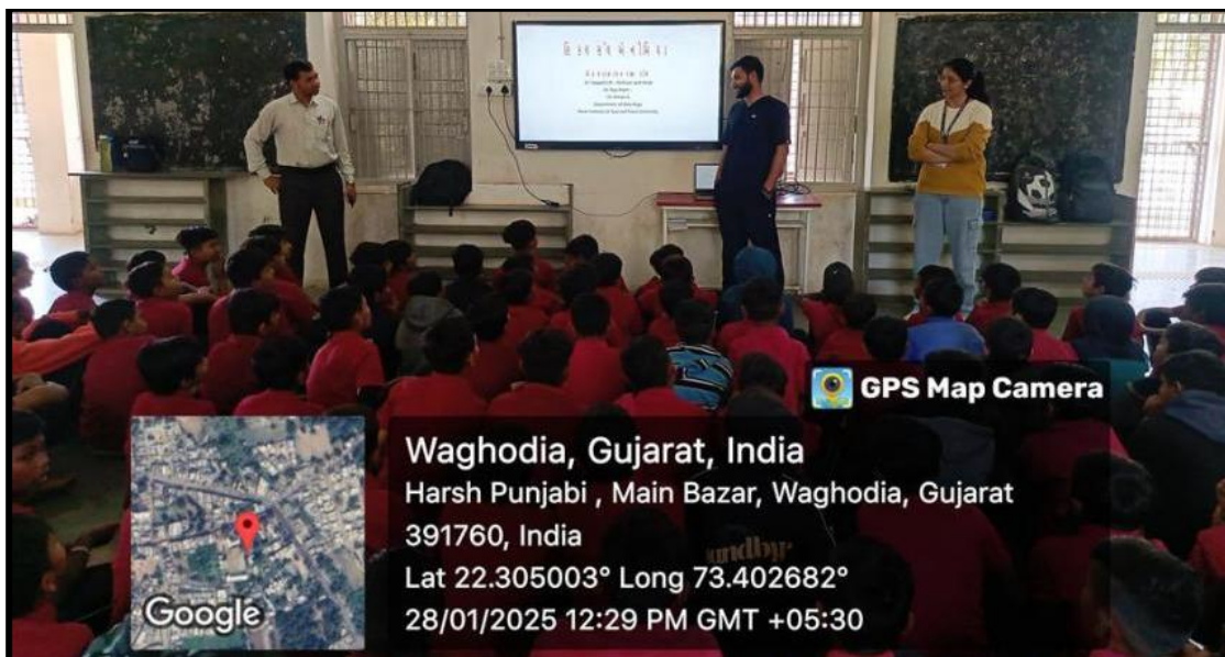
Sickle Cell Anemia Awareness Talk at Waghodia Kumar Shala