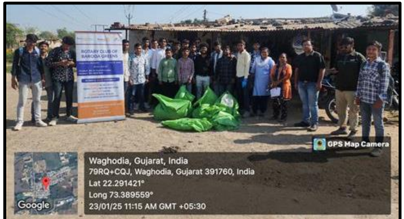
Awareness Rally and Swachhata Abhiyan at Gugaliyapura Village